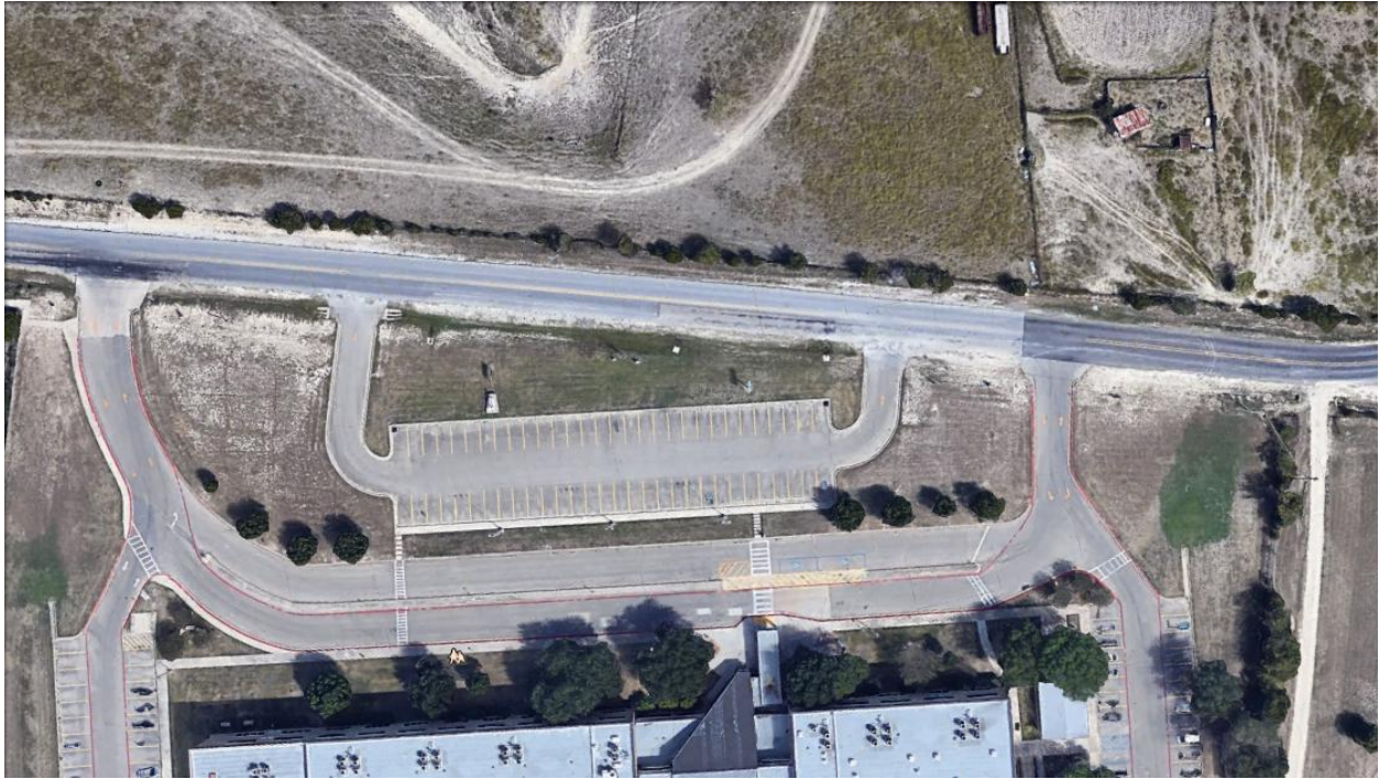
Ariel view of the front of Nolanville Elementary School